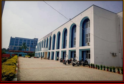
Shri Sadashiva Campus, Puri

Vidyashakha mail ID : - nyayaexam@gmail.com